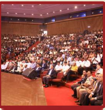
Seminars & Workshop