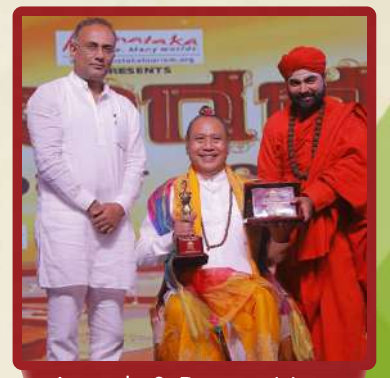
Awards & Recognitions